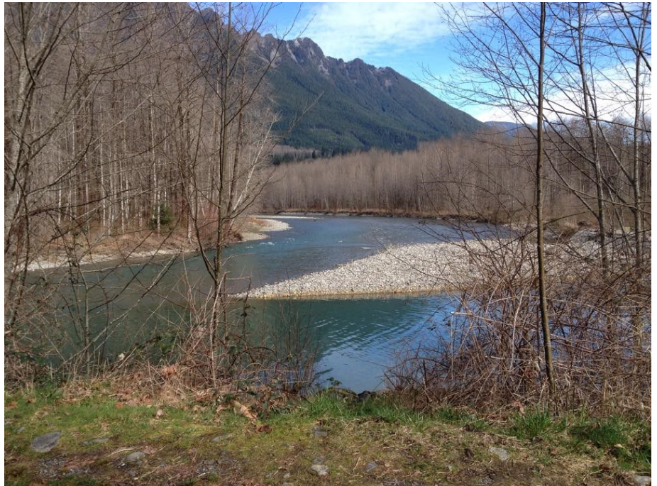
Thanks Cindy Proctor for this lovely picture along the McClinchy Mile Ride route!

This Scenic Oregon Bikeway covers some of the route traveled by pioneers on the Oregon Trail. Enjoy stunning mountain views of the Elkhorn Range, the Blue Mountains and the Eagle Caps of the Willowa Mountains. Other nearby activities include golfing, hiking, swimming and mountain biking.